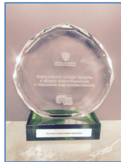
2014 ENES Award

A Russian – Norwegian initiative in energy efficiency