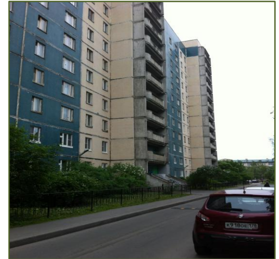
Example of apartment building in St Petersburg